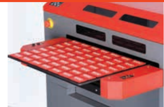
iUV-350s - Print area A3+[604x350] iUV-600s - Print area A2+ [604x450] iUV-1200s - Print area A0- [1150x750mm]

Bringing print production in-house, the time saved on logistics and handling allows for significant cost savings and faster reaction to changing market needs.