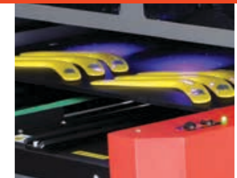
Dual water cooled LED lamps. 395Nm low heat. (iUV-350s single lamp)