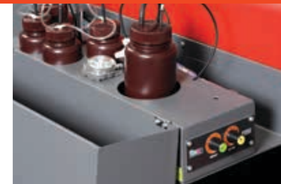
Bulk ink system with WIMS® ink circulation and filtration.

The Compress iUV industrial print head features 1440 nozzles capable of delivering a minimum picolitre drop of just 3.5Ng for ultra fine dot placement. When configured with up to 6 colors of CMYK – White and Clear, our 1150mm wide print width delivers 1440 dpi native print resolutions at incredible speed with remarkable color brilliance. Maximum print area of the iUV-350s is 604mm x 350mm (A3+) with an adjustable media height to 150mm. Maximum print area of the iUV-600s is 604mm x 450mm (A2+) with an adjustable media height to 300mm (the largest media height of any printer in its class). Maximum print area of the iUV-1200s is 1150mm x 750mm (A0-) with an adjustable media height to 300mm (again the largest media height of any printer in its class). Speeds up to 300 feet per hour in production mode and 50 feet per hour in quality mode. Each ink color is delivered via a 250ml pressurized ink tank for constant ink feed to the damper. All white inks are pressurized and recirculated with filtering by our patent pending WIMS (white ink management system) for less downtime and ink issues in general... low maintenance. PRODUCTION READY.