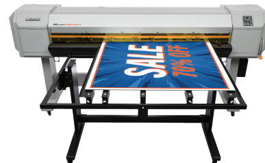
ValueJet 1638UR Mark II