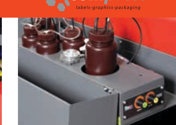
Bulk ink system with WIMS® ink circulation and filtration.

The Compress iUV industrial print head features 1440 nozzles capable of delivering a minimum picolitre drop of just 3.5Ng for ultra fine dot placement. When configured with up to 6 colors of CMYK - White and Clear, our 1150mm wide print width delivers 1440 dpi native print resolutions at incredible speed with remarkable color brilliance.