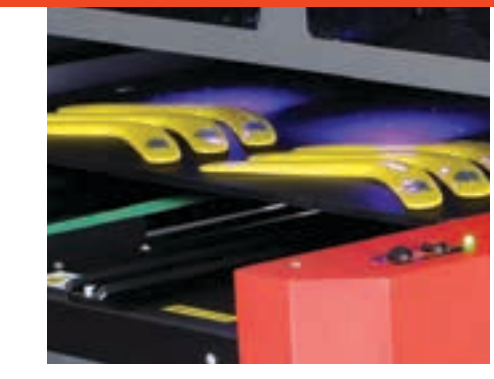
Dual water cooled LED lamps. 395Nm low heat. (iUV-350s single lamp)