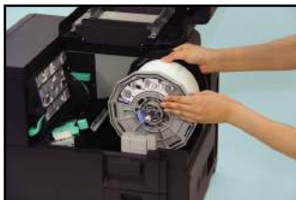
Easy label roll replacement