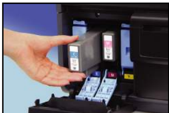
Simple ink cartridge replacement

* Specifications subject to change without notice